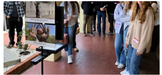
Los Angeles, workshop and traveling museum