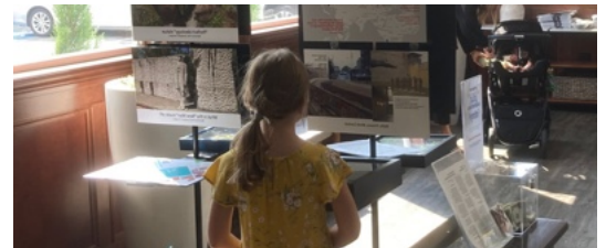
Portland, traveling museum