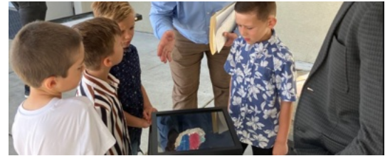
Sacramento, traveling museum