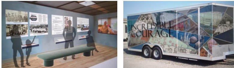
* Concept designs of the future traveling museum

Workshops - The workshop is an interactive one or two-day experience (3-5 hours total) where your members will read, act, discuss, and engage in activities to discover what courage may look like in their life. They will explore their or their family's stories of courage and reflect on Stories of Incredible Courage from the Overcome archive and books. Each workshop includes access to the Traveling Museum.