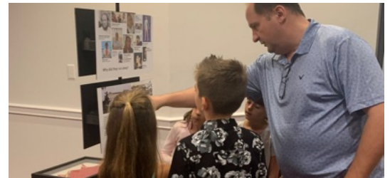
Florida, traveling museum